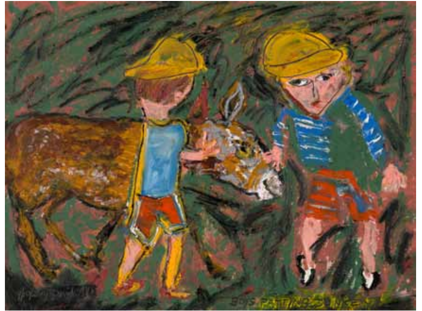
13. Boys patting donkey 2019 OIL PASTEL ON ARCHES PAPER 46 × 61 cm