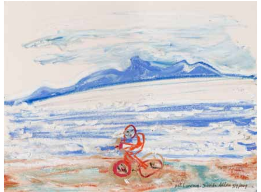
17. Mt Larcom 2019 OIL PASTEL ON ARCHES PAPER 46 × 61 cm