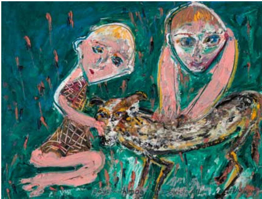
24. Boys with dog 2019 OIL PASTEL ON ARCHES PAPER 46 × 61 cm