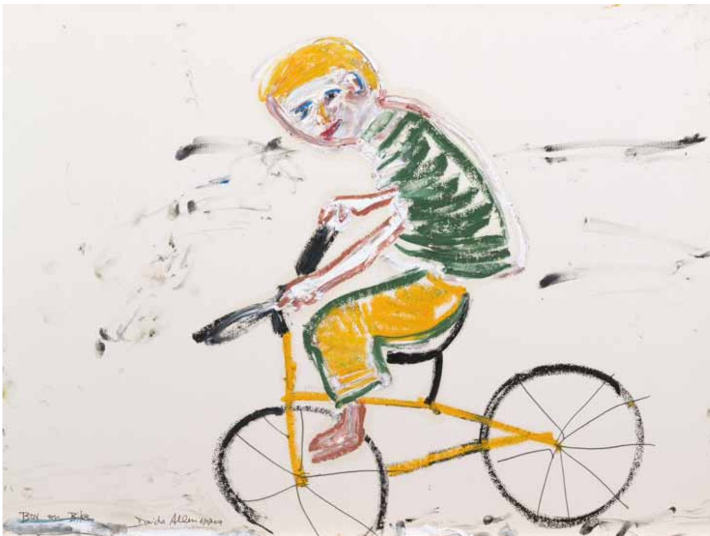
9. Boy on bike 2019 OIL PASTEL ON SAUNDERS WATERFORD PAPER 75 × 100 CM