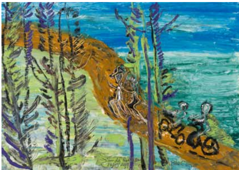
26. Bike circuit 2019 OIL PASTEL ON ARCHES PAPER 36 × 50 cm