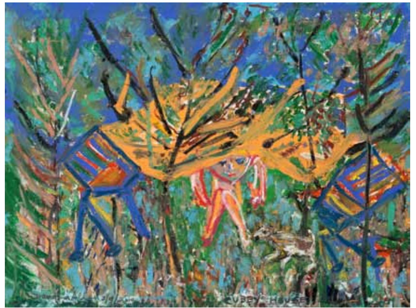
15. Cubby house 2019 OIL PASTEL ON ARCHES PAPER 46 × 61 cm