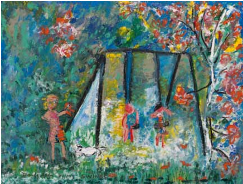
22. Swings 2019 OIL PASTEL ON ARCHES PAPER 46 × 61 cm