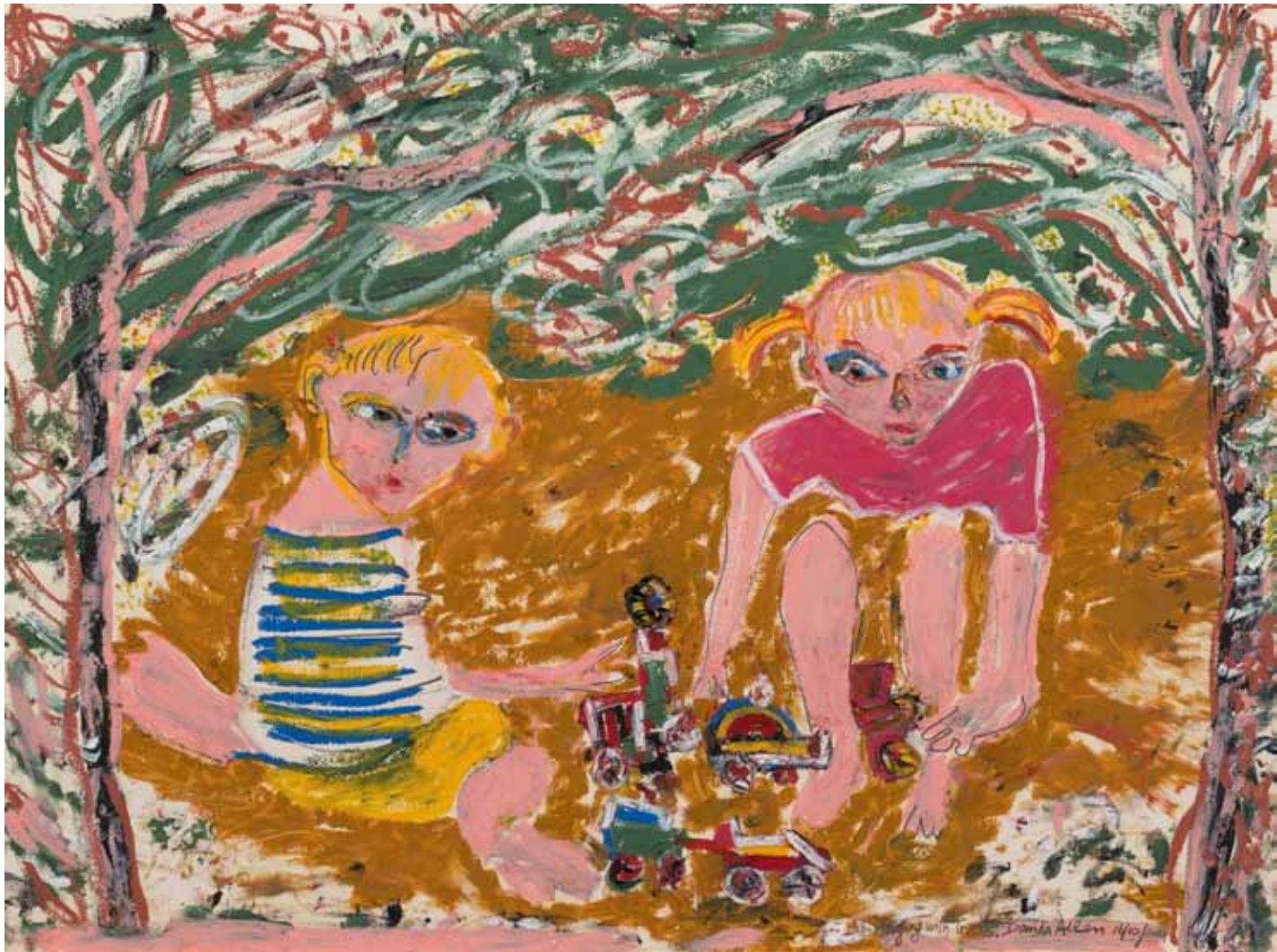
7. Playing with trucks 2019 OIL PASTEL ON SAUNDERS WATERFORD PAPER 75 × 100 CM