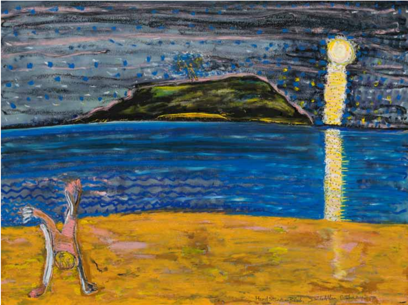
4. Hand stands on beach 2019 OIL PASTEL ON SAUNDERS WATERFORD PAPER 75 × 100 CM