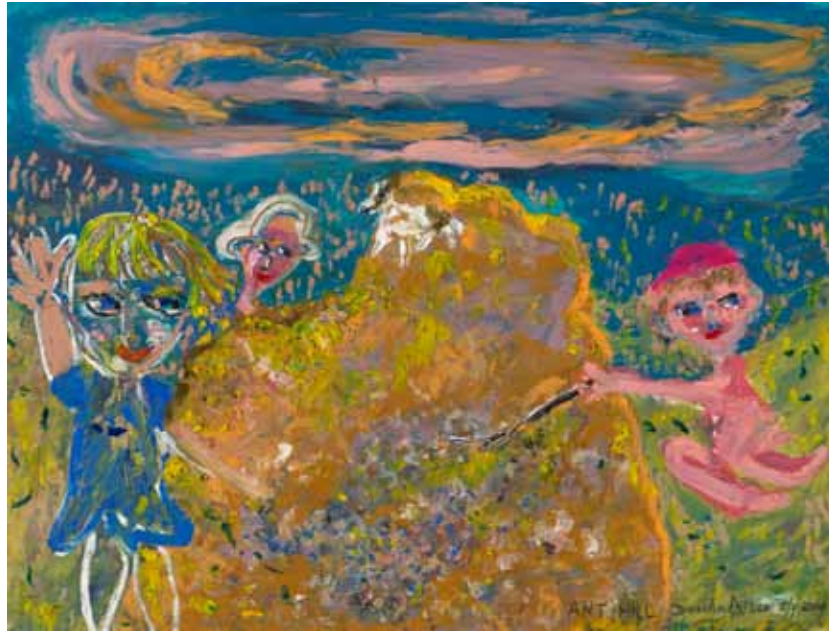
11. Ant hill 2019 OIL PASTEL ON ARCHES PAPER 46 × 61 cm