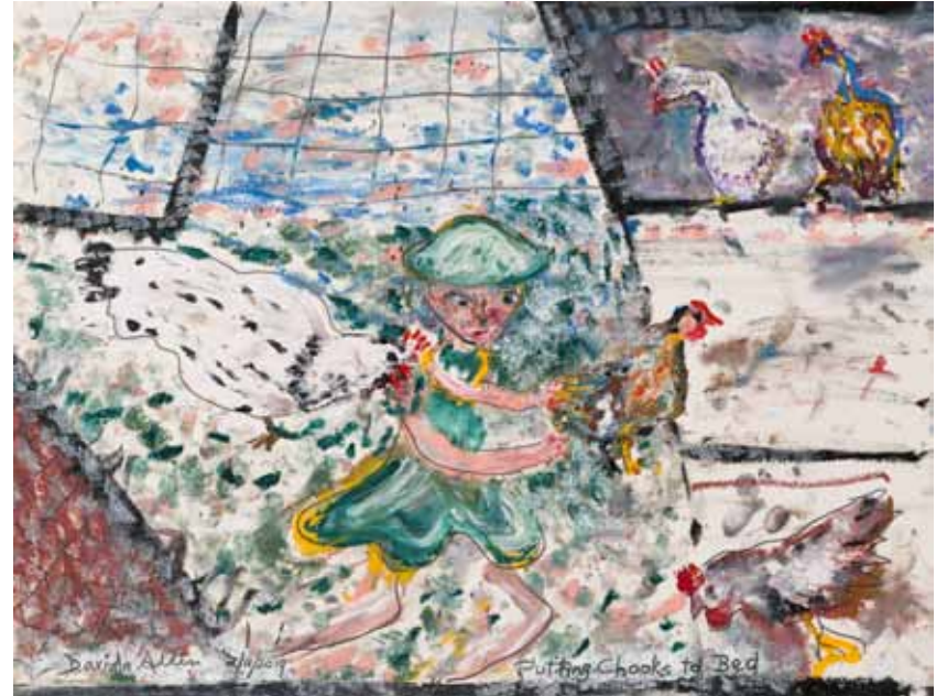
19. Putting chooks to bed 2019 OIL PASTEL ON ARCHES PAPER 46 × 61 cm