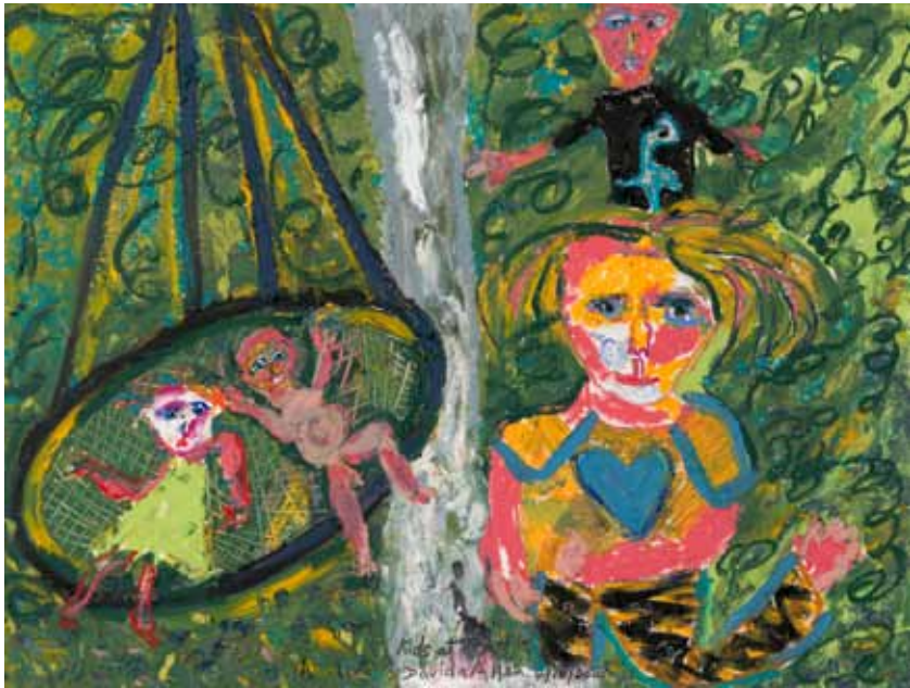
16. Kids at park 2019 OIL PASTEL ON ARCHES PAPER 46 × 61 cm