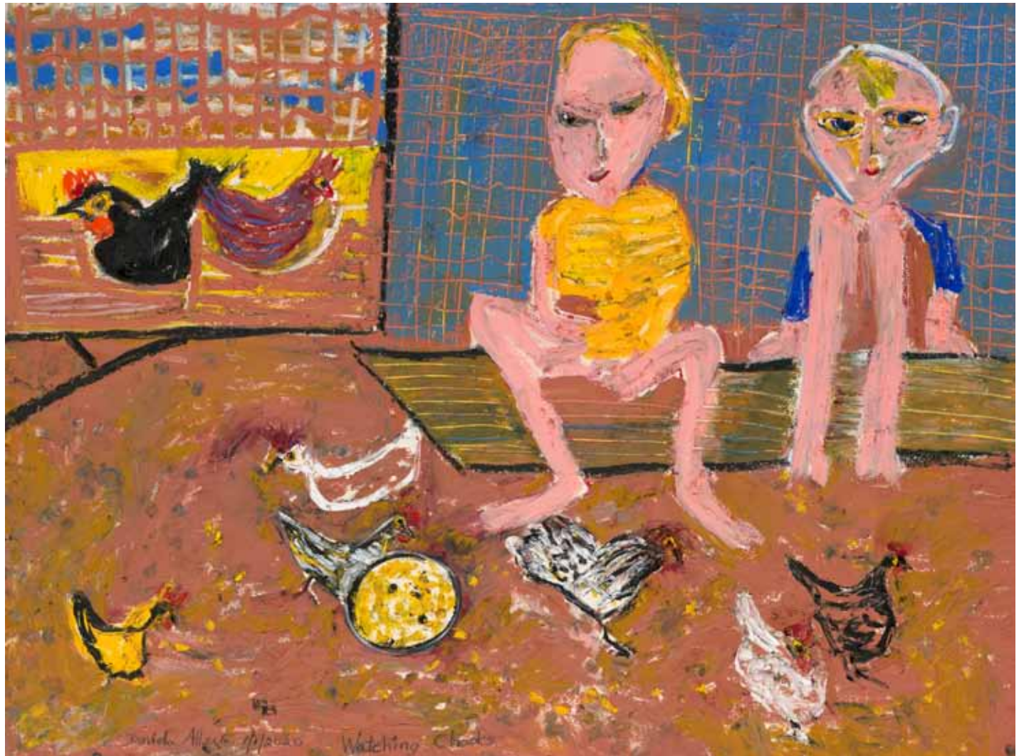
10. Watching chooks 2020 OIL PASTEL ON SAUNDERS WATERFORD PAPER 75 × 100 CM