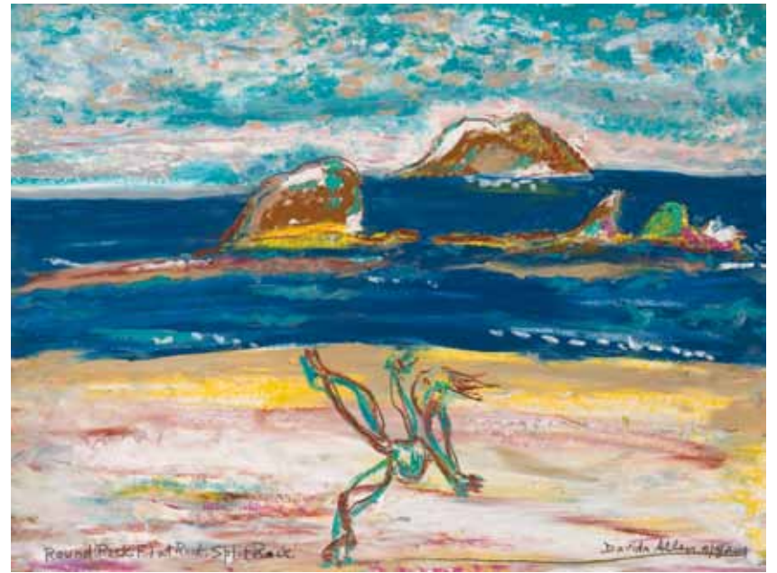
20. Round rock. Flat rock. Split rock. 2019 OIL PASTEL ON ARCHES PAPER 46 × 61 cm