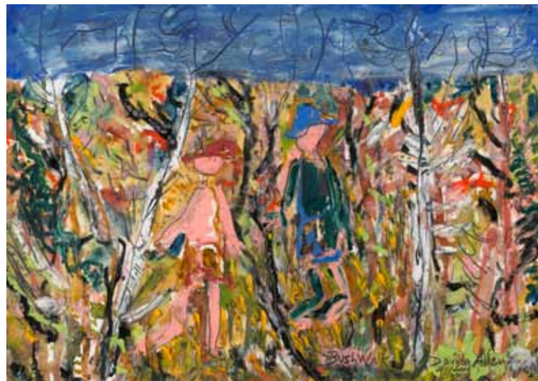
27. Bushwalk 2019 OIL PASTEL ON ARCHES PAPER 36 × 50 CM

University of Sydney Art Collection, Sydney