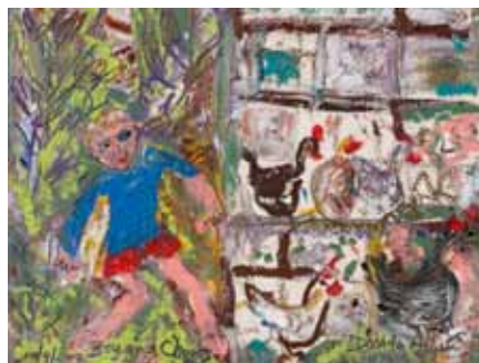
31. Boy and chooks 2019 OIL PASTEL ON ARCHES PAPER 23 × 30 CM