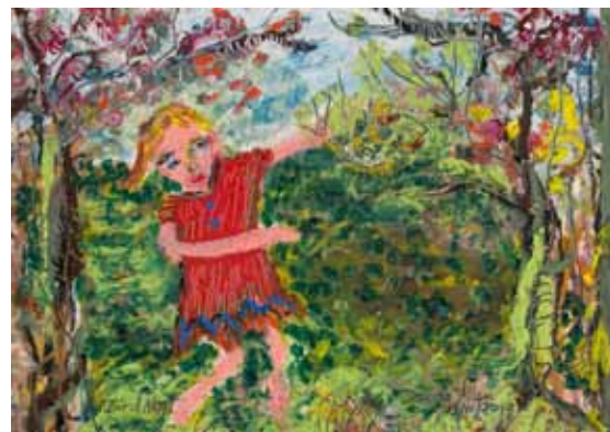
29. Bird nest 2019 OIL PASTEL ON ARCHES PAPER 25 × 36 cm