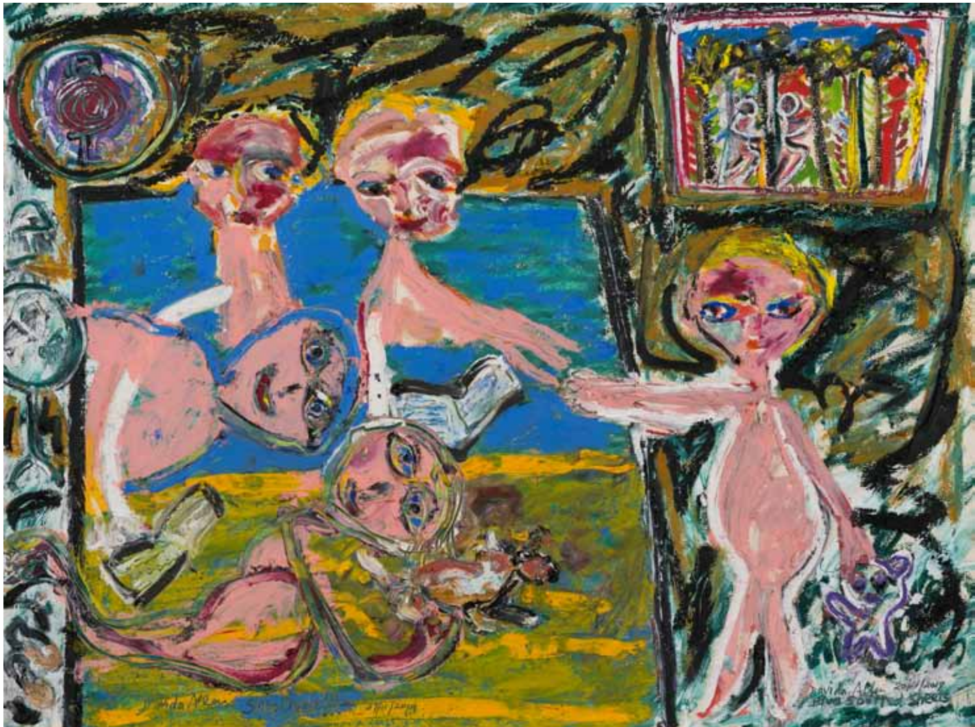
1. Sleepover 2019 OIL PASTEL ON SAUNDERS WATERFORD PAPER 75 × 100 CM