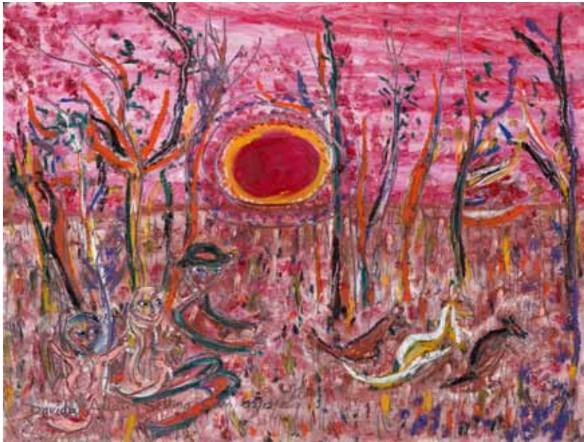
21. Setting sun 2019 OIL PASTEL ON ARCHES PAPER 46 × 61 cm