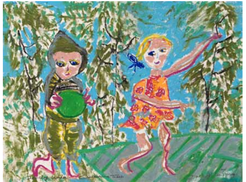
25. Dancing under casuarina trees 2019 OIL PASTEL ON ARCHES PAPER 46 × 61 cm