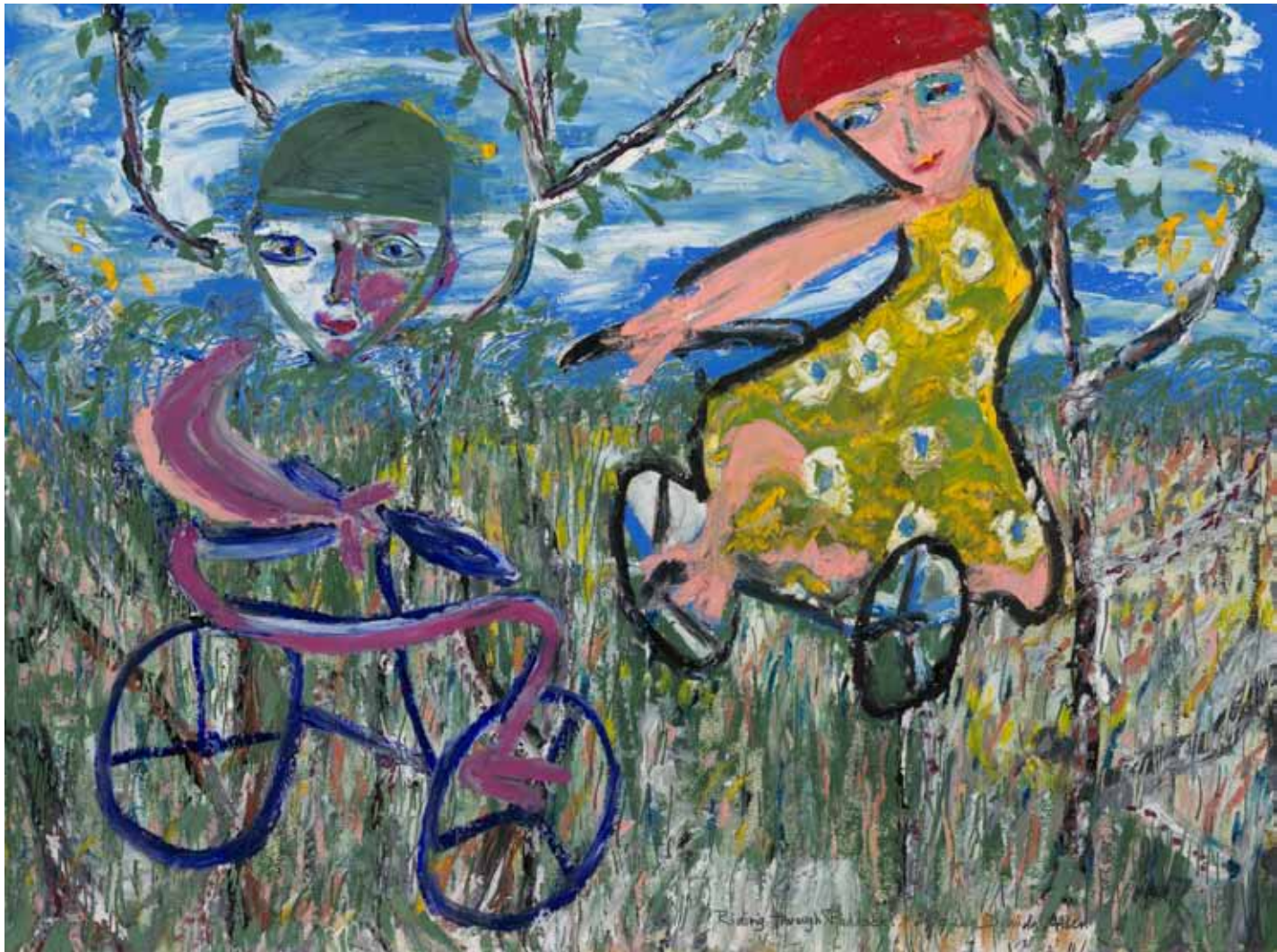
8. Riding through paddock 2019 OIL PASTEL ON SAUNDERS WATERFORD PAPER 75 × 100 CM