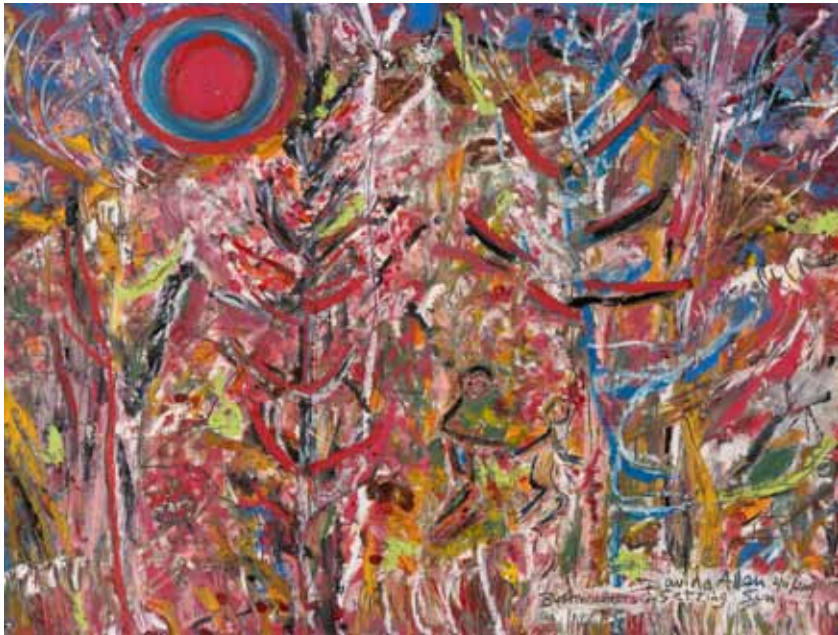
14. Bushwalkers in setting sun 2019 OIL PASTEL ON ARCHES PAPER 46 × 61 cm