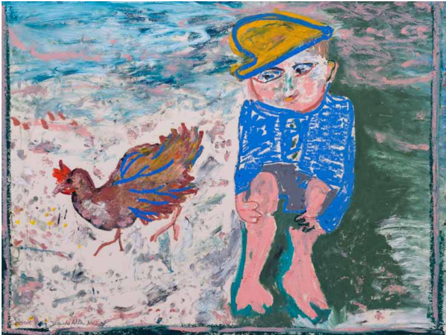
above: 2. Chook 2019 OIL PASTEL ON SAUNDERS WATERFORD PAPER 75 × 100 CM