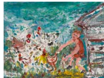
32. Scattering seed 2019 OIL PASTEL ON ARCHES PAPER 23 × 30 CM