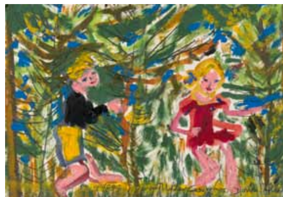
30. Dancing under casuarinas 2019 OIL PASTEL ON ARCHES PAPER 25 × 36 cm