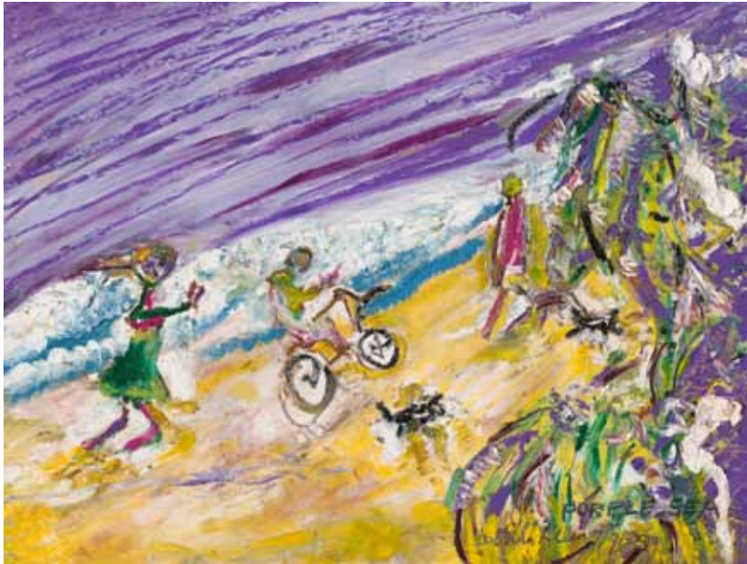
18. Purple sea 2019 OIL PASTEL ON ARCHES PAPER 46 × 61 cm