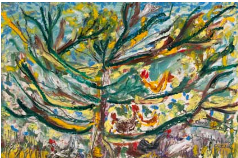
28. Chooks in tree 2019 OIL PASTEL ON ARCHES PAPER 30 × 46 cm