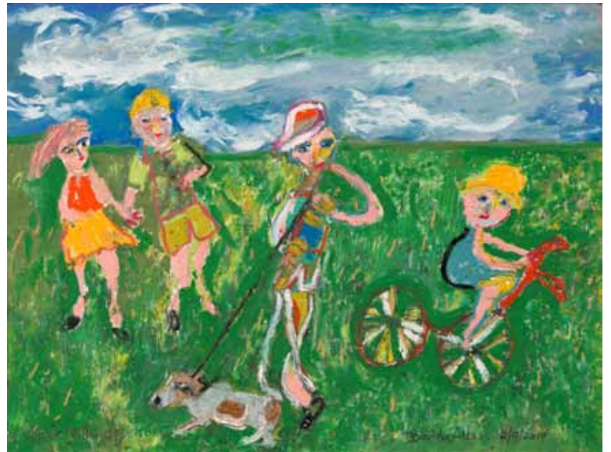
23. Walking the dog 2019 OIL PASTEL ON ARCHES PAPER 46 × 61 cm