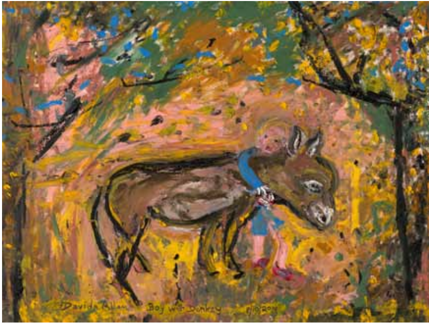
12. Boy with donkey 2019 OIL PASTEL ON ARCHES PAPER 46 × 61 cm